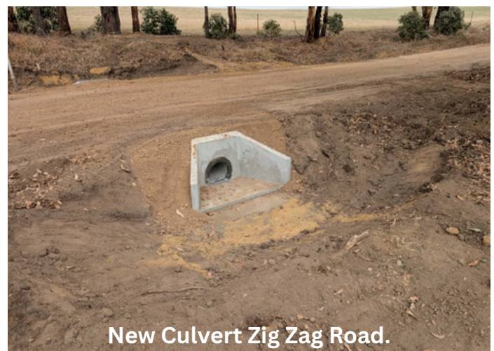
New Culvert Zig Zag Road.

Once completed, the program will deliver improved drainage performance, reduced maintenance requirements, and greater reliability of the road network during heavy rainfall events.