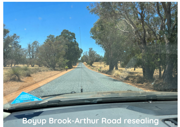
Boyup Brook-Arthur Road resealing

Summer grading is now 90% complete with the remainder due to be finished by the end of April. Bridge inspections and bridge maintenance have been completed for the 2023/2024 year.