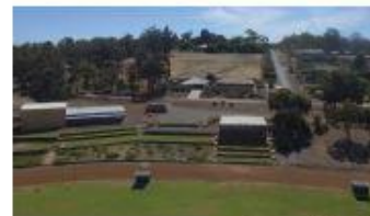
Boyup Brook Football Oval

Council will discuss potential projects for Round 2 at the February Council meeting.