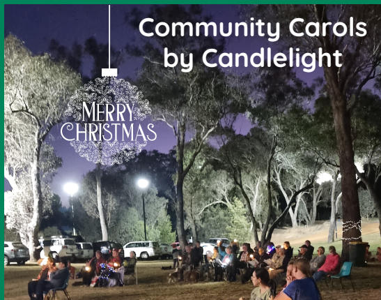
Community Carols by Candlelight

A wonderful evening was had by all at Carols by Candlelight on Friday 2nd December 2022.