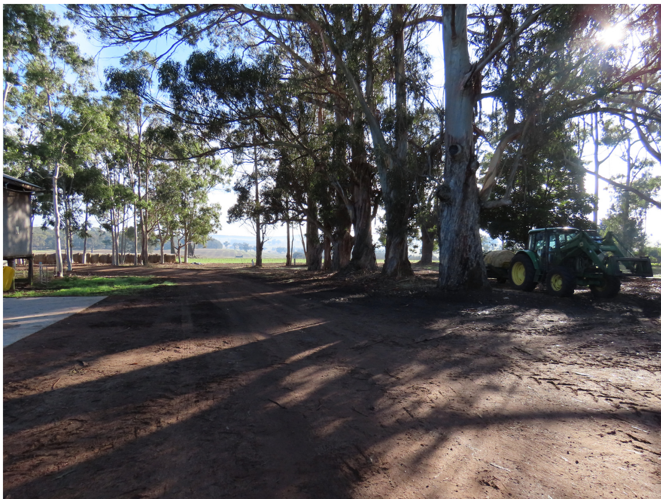
Photo taken at Rylington Park

The Shire of Boyup Brook's Annual Financial Statements and the (independent) auditor's report of Office of the Auditor General are included in the attached documents.